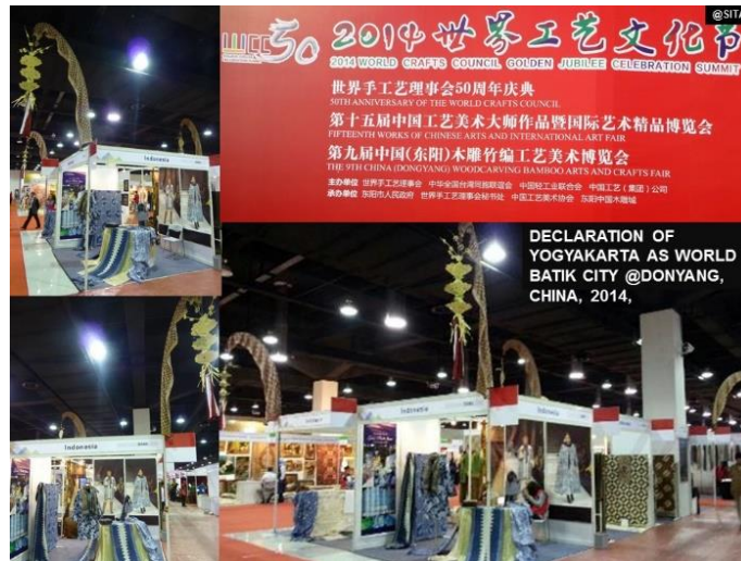
Yogyakarta was declared by the World Crafts Council as the World Batik City at Donyang, RCC, 2014.